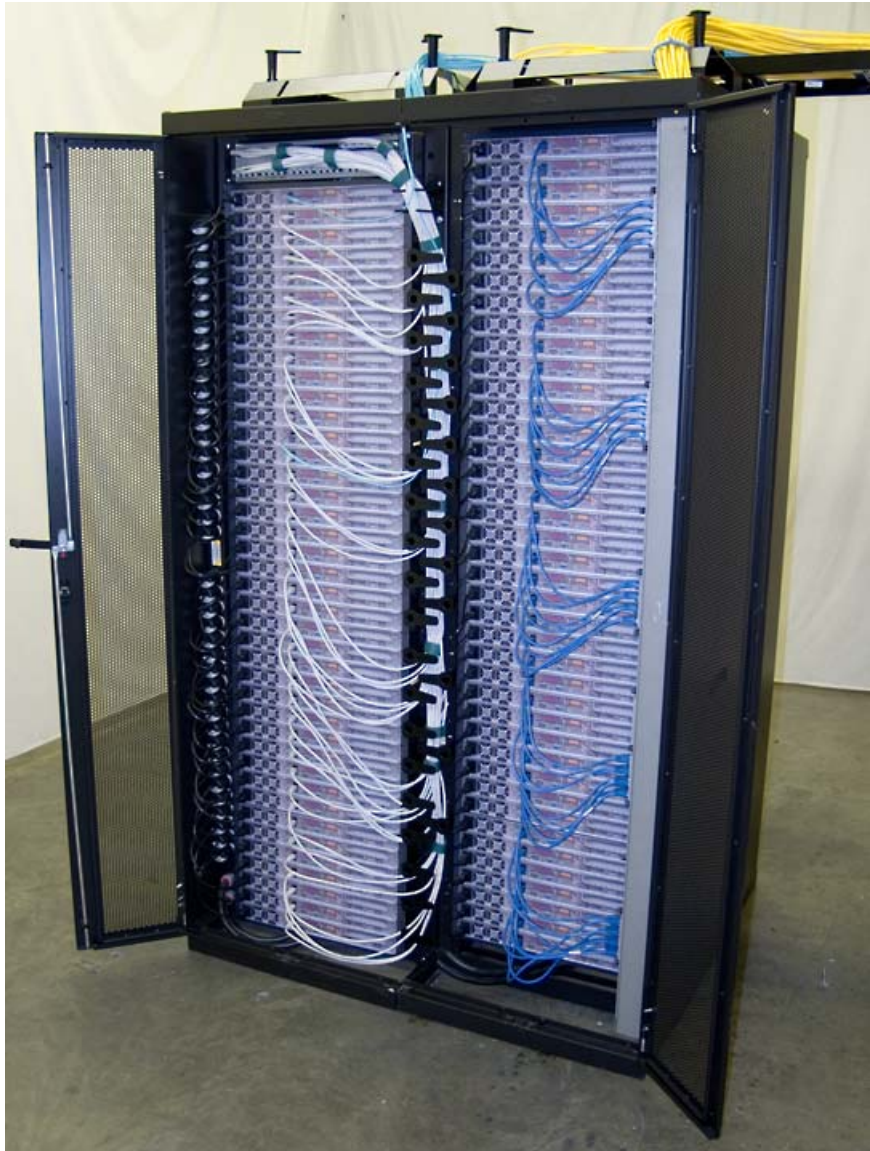
Figure 1: Comparing Vertical Patch Panels to Standard Patch Panels in Server Applications